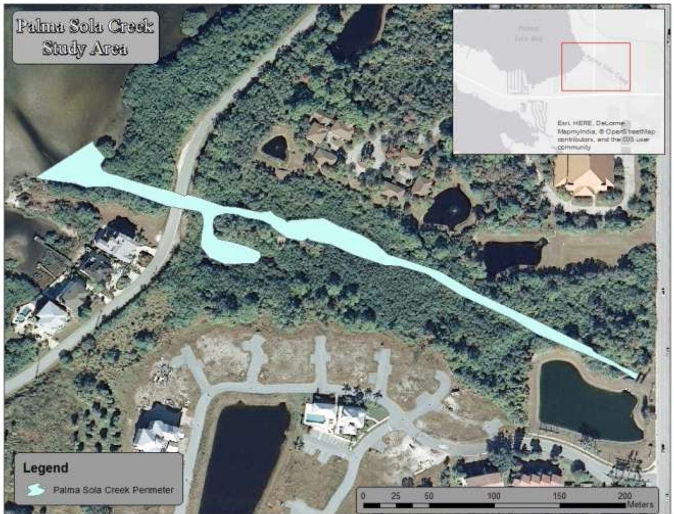
Figure 41. Overview of the Palma Sola Creek Study Area

Palma Sola Creek has a watershed that is dominated by residential (40.14%), natural/open land (18.88%) and pasture (9.09%) with an LDI of 30.09. Palma Sola Creek flows into Palm Sola Bay north of Cortez Road in Manatee County.