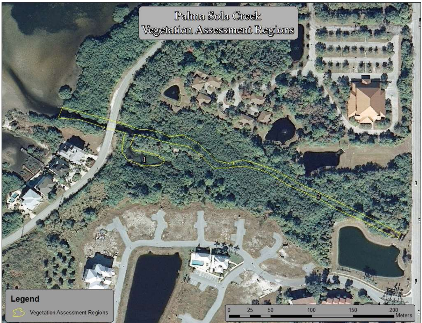
Figure 42. Overview of Palma Sola Creek Vegetation Assessment Regions

The Palma Sola Creek vegetation assessment encompassed 2 vegetation regions from the mouth in Palma Sola Bay to 75 th Street West as shown in Figure 42. In these regions, 20 species of vegetation were identified. Region 1 was dominated by mangroves ( Rhizophora mangle , Laguncularia racemosa and Avicennia geminans ) with few other salt tolerant species present. The most upstream mangrove was in Region 2. The first occurrence of Leather Fern ( Acrostichum danaeifolium ) was in Region 1. Needle Rush ( Juncus roemerianus ) was also first observed in Region 1. Above Region 2 the vegetation communities are populated by many species indicative of dominating freshwater influence. The main channel of Palma Sola Creek is very congested with mangroves and Brazilian Pepper ( Schinus terebinthifolius ). It was not possible to travel upstream past the beginning portion of Region 2. At 75 th Street many species of freshwater vegetation were observed and none of the typical salt water species were observed.