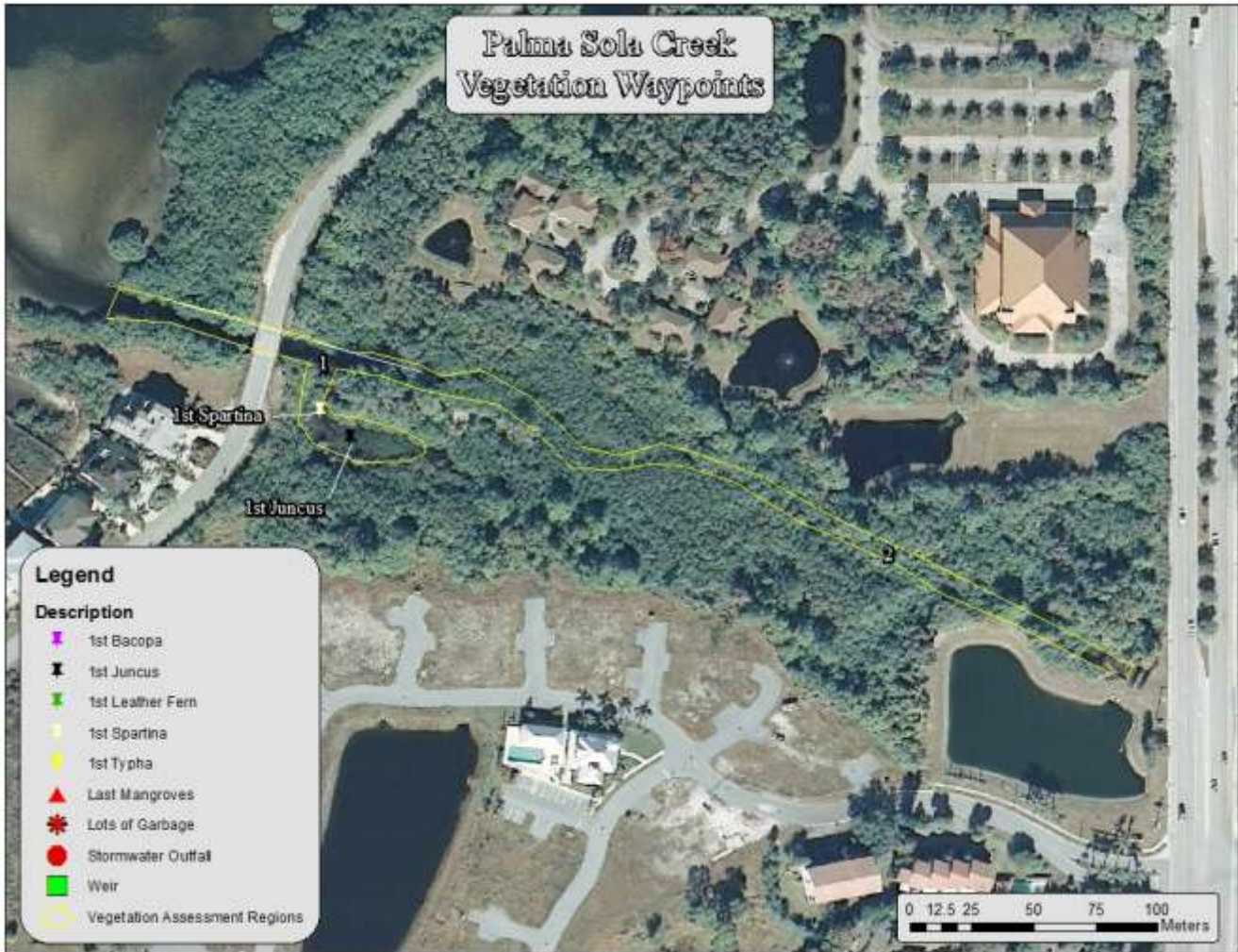
Figure 43. Palm Sola Creek Vegetation Waypoints

Figure 43 shows the vegetation transition zone of Palm Sola Creek indicating the most downstream Juncus and Spartina . Based on the vegetation assessment data for Palma Sola Creek, Region 1 and 2 would comprise the highest salinity and tidal influence zone. The upper portion of Region 2 would comprise the “mixing” zone and above Region 2 would comprise the freshwater dominant zone. The vegetation assessment species list is shown in Table 13.