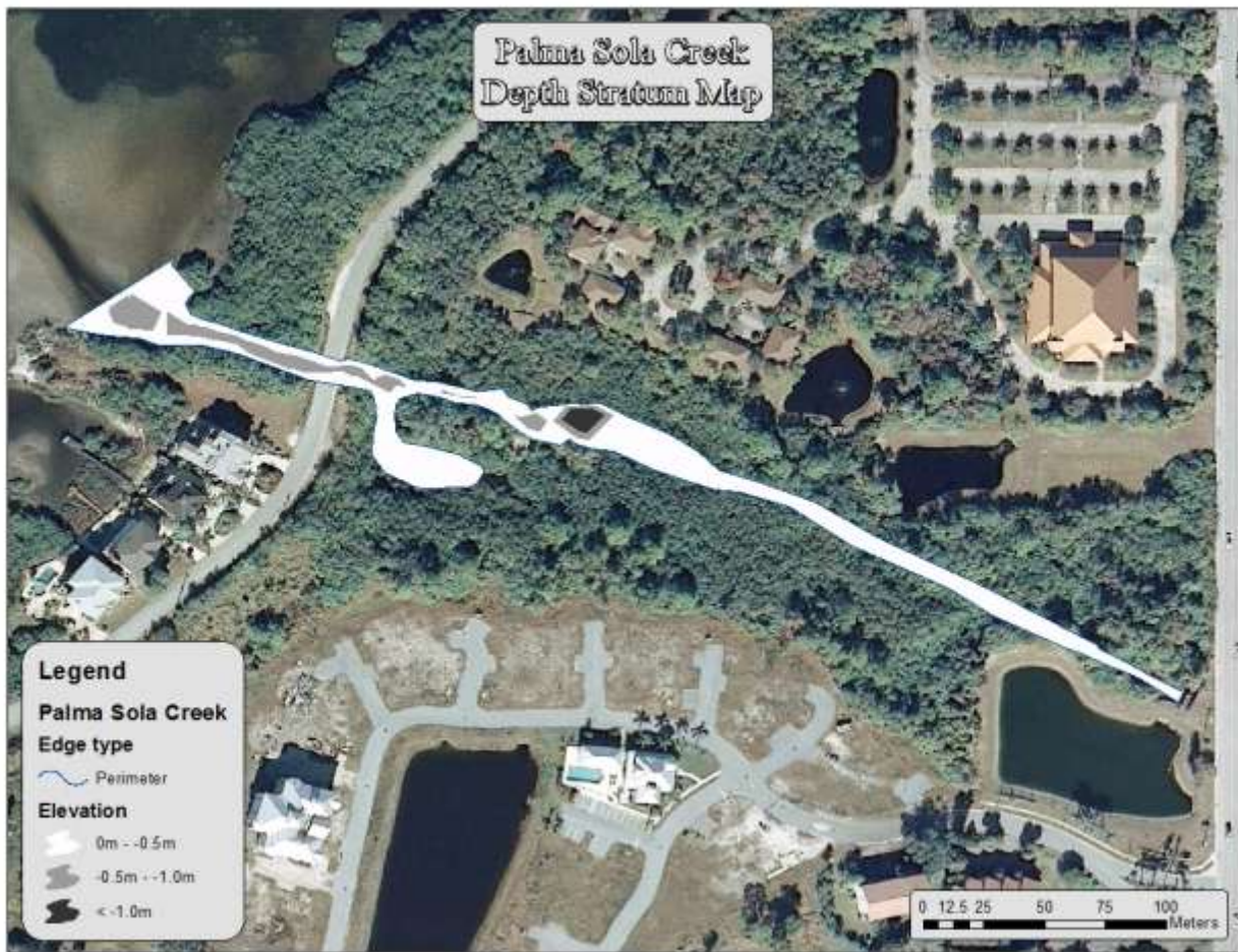
Figure 45. Palma Sola Creek Bathymetric Stratum Map

In the study area, Palma Sola Creek had a mean depth of 1.88 feet and a maximum depth of 4.44 feet. A total of 1.27 acres of creek was mapped during the assessment. At the time of assessment, Palma Sola Creek contained an estimated 41,849 gallons of water in the study area. The water level elevation at the time of the assessment was 2.51 feet at SWFWMD 26206. Figure 45 details the bathymetric mapping for South Creek showing the three depth strata.